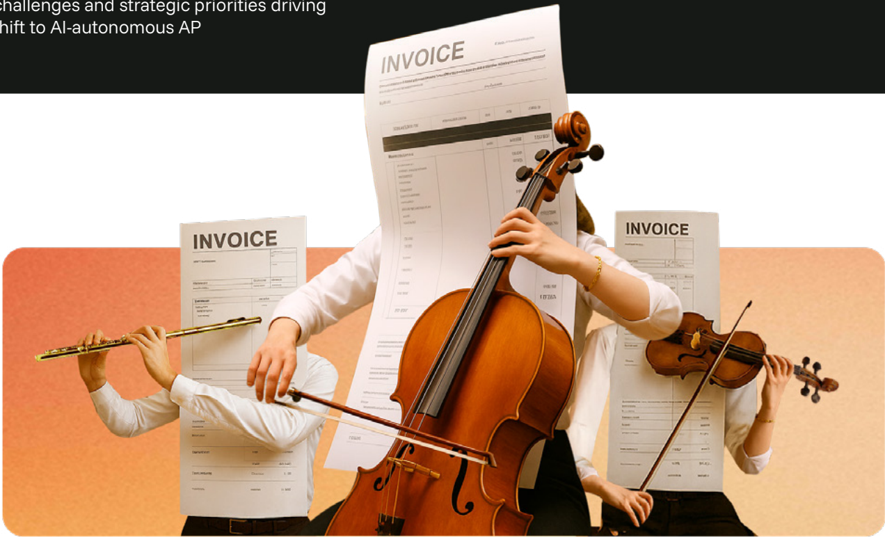
Figure 2: Key challenges and strategic priorities driving the shift to AI-autonomous AP